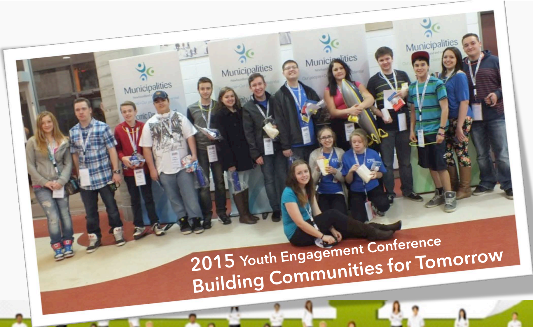
2015 Youth Engagement Conference Building Communities for Tomorrow